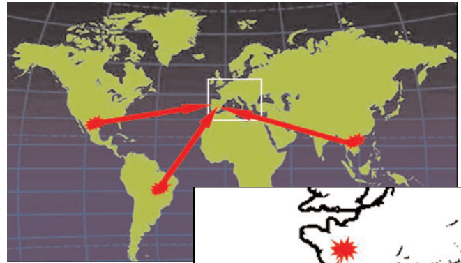
(TOP): Path of Counterfeit Ingredients to Spanish Facility

Authorities disclosed that the ingredients were