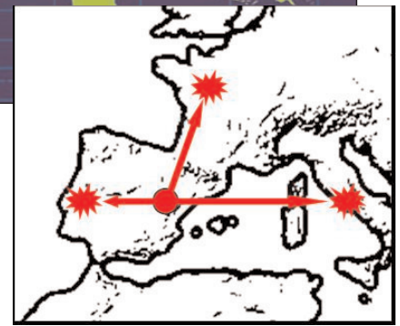
(RIGHT): Confirmed Export Paths

obtained to make the counterfeit products from Mexico, Brazil, and Thailand.